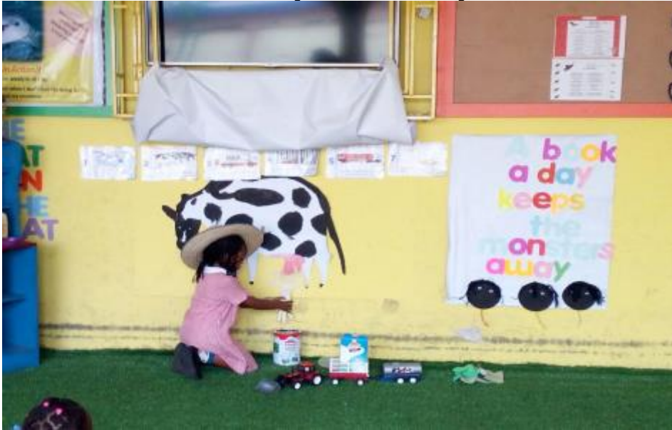
Lower Nursery presentation on the journey of milk; from the cow in the farm to our cereal bowls for breakfast!