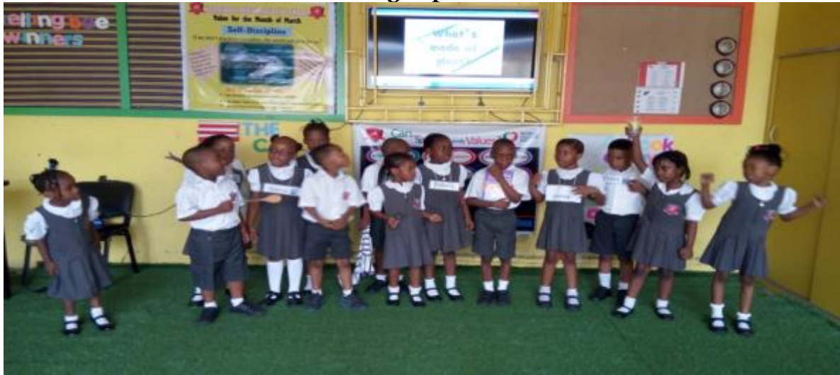
Monday Morning Assembly - Year 1 Children gave a presentation on types of materials. A video recording can be watched on KPS' YouTube site. https://www.youtube.com/channel/UCI-7upva_2pBpXsg41Sgdtw