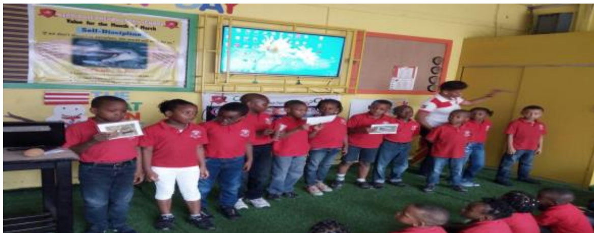
Year 2 class assembly, presentation on explanatory text